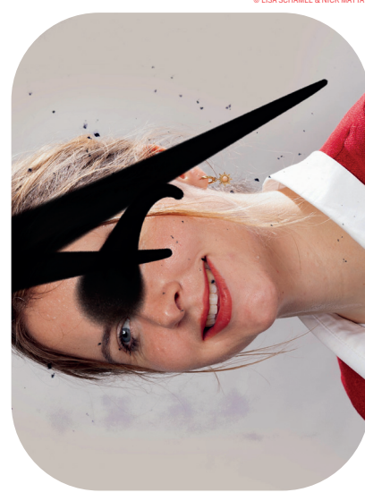
© LISA SCHAMLE & NICK MATTAN

*→12–17, 19-24 Aug, ZOO Southside, venue 82 15:30-16:45